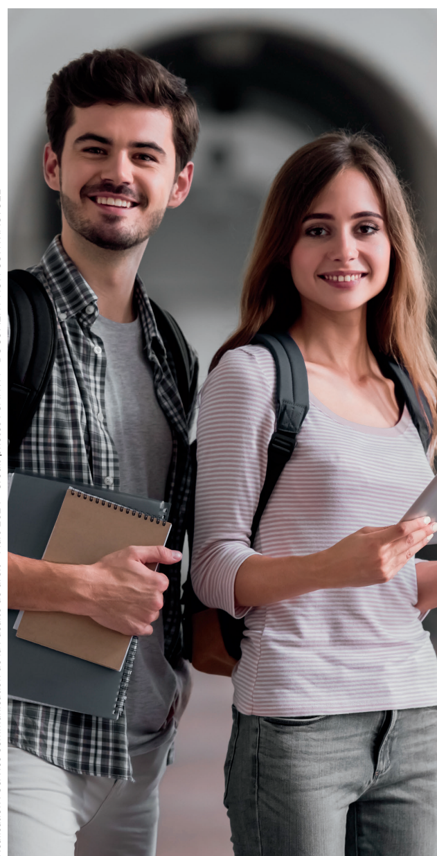
Réalisation : Service communication de la Faculté de droit - Mars 2024 - DOCUMENT NON CONTRACTUEL